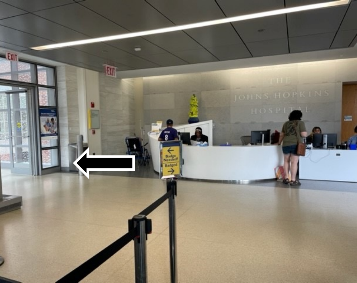
After checking in at hospital reception desk, proceed through doorway on the left