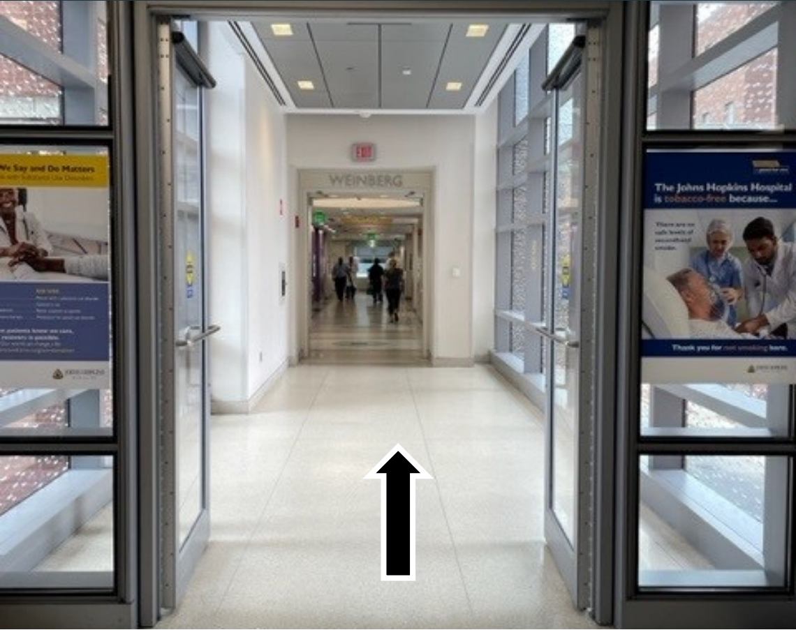
(Doorway shown here)